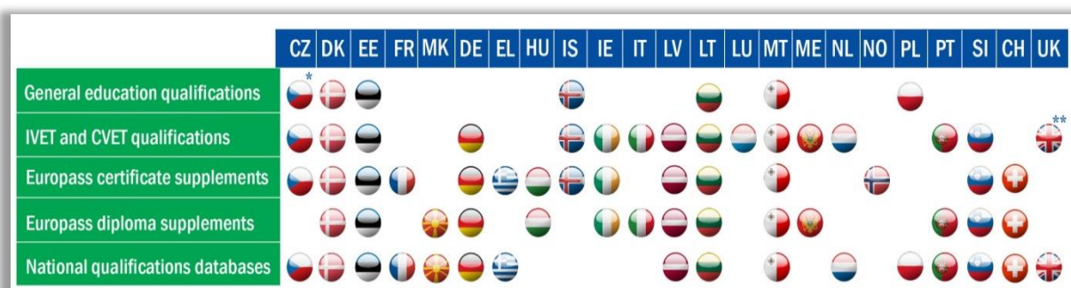
Figure 1. Including NQF/EQF levels in qualifications documents and/or databases

Several countries have indicated their intention to do so in 2017: Austria, Belgium-fl and Belgium-fr, Bulgaria, Finland and Turkey. Countries such as Denmark, Estonia, Lithuania and Malta have included references to NQF/EQF levels in all their qualifications documents; Finland is signalling its intention to do so after completing referencing in 2017.